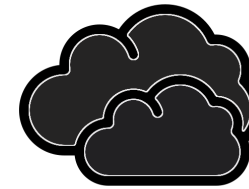
Scent of the twin brother

The master's scent is unique. If two are riding together, he recognizes the master's scent. Even if you have an identical twin brother who eats differently, the dog recognizes the master's scent.