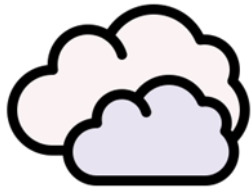
Scent of the dog owner

Recognize the individual smell of the person